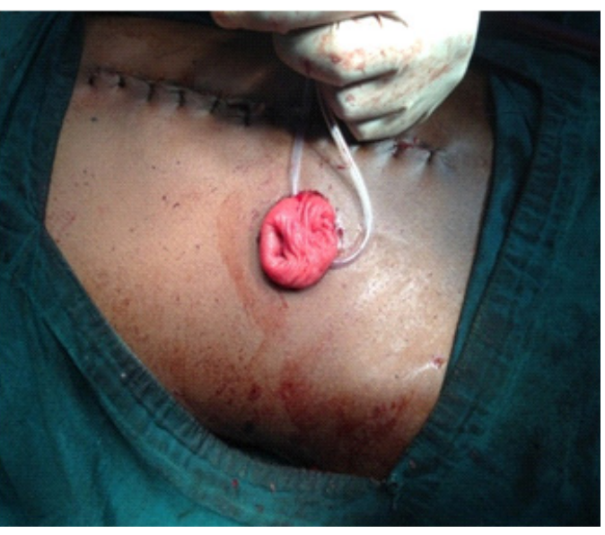
Figure 7. Loop Ileostomy